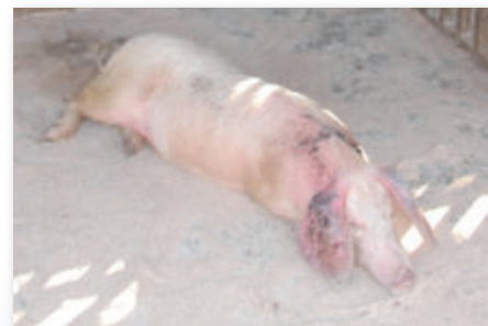
Decreased appetite, listlessness, cyanosis and mobility incoordination within 24-48 hours before death