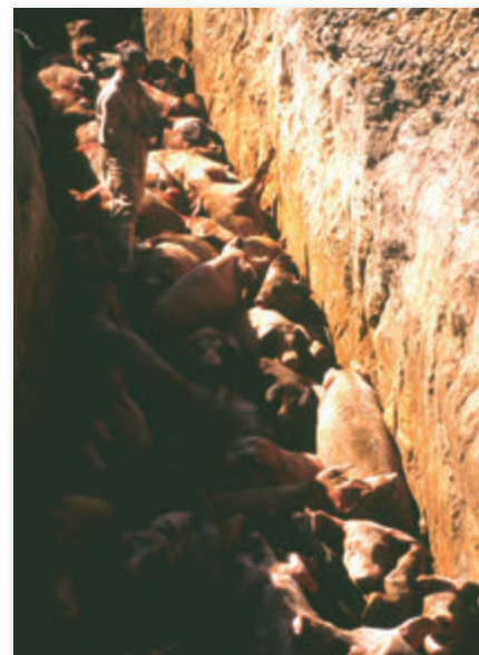
Disposal of carcasses