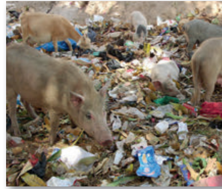
Feeding on garbage