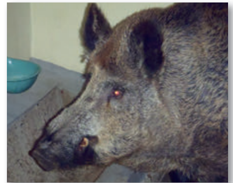
European wild boars