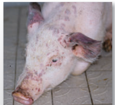
Domestic pigs