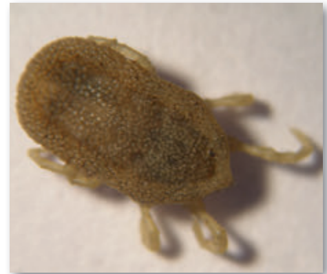
Ornithodoros spp.