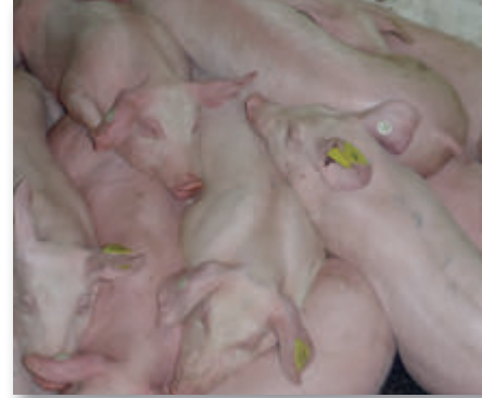
Sudden death of animals with few signs