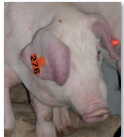
Reddening of the tip of the ears